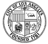
Exhibit G - OFW Lights Letter

In recent weeks, the replacement lights installed along Ocean Front Walk have been inconsistent and incompatible with the original, low impact amber lights. The replacement lights are bright-white and create or contribute to unnecessary light pollution along the boardwalk, beach, coastline and skyline. The recently installed replacement lights are more suitable to a K-Mart parking lot or parking garage and are not appropriate for the boardwalk. An example of inappropriate lighting may be found (after dark) at 701 Ocean Front Walk. The original amber colored lights provide ample lighting for nighttime pedestrians and community safety.