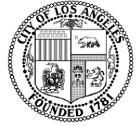
Exhibit G – Draft Letter re: Maintaining Police Deployment in Venice