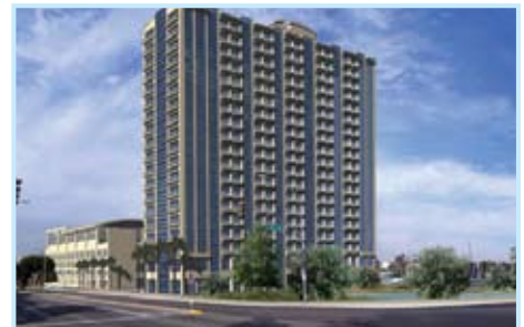
19-story Woodfin Hotel and 5-story parking planned at Tahiti Way and Via Marina.

County Supervisors will hold a meeting downtown about five individual development projects on April 26th, prior to the