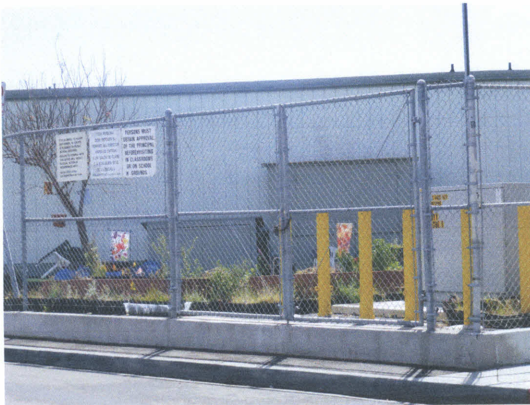
View of Westside Global Awareness Magnet from Strongs Drive.