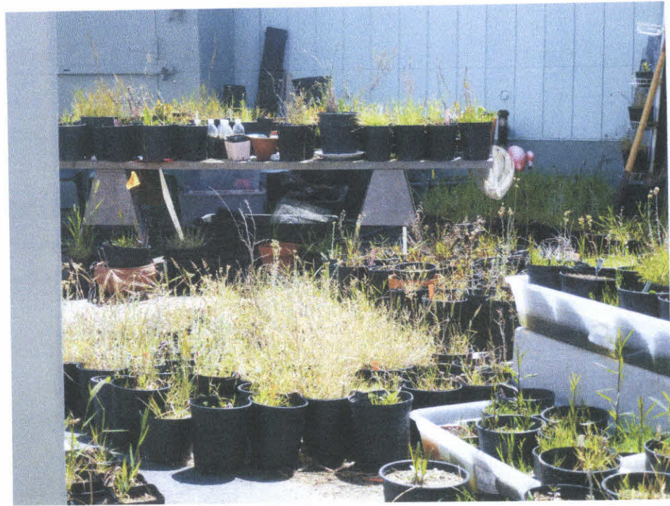
Native plants in Ballona Institute storage area.