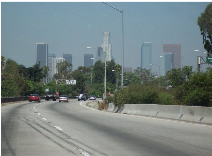
Our City Skyline Today