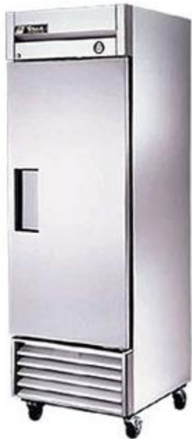
Solid Door Refrigerator, 1 Door, 23 Cu. Ft., S/S