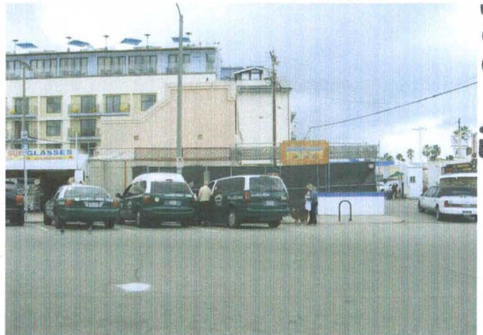
8 (Taken from across Windward Ave at the front of the Property)