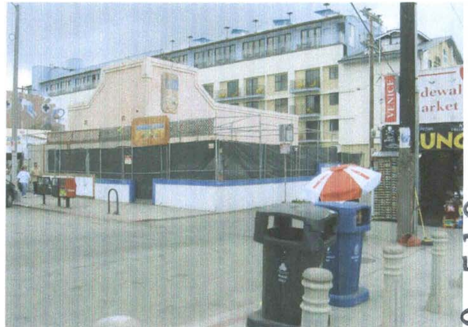
2 (Taken from Windward Ave towards the front of property)