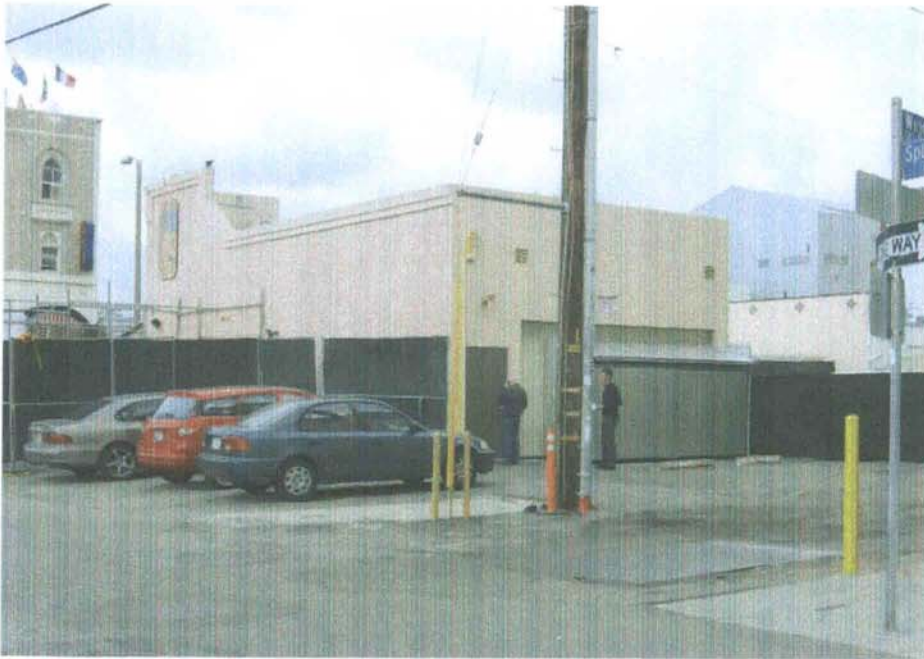
1 (Taken from Speedway looking towards the rear of the property )