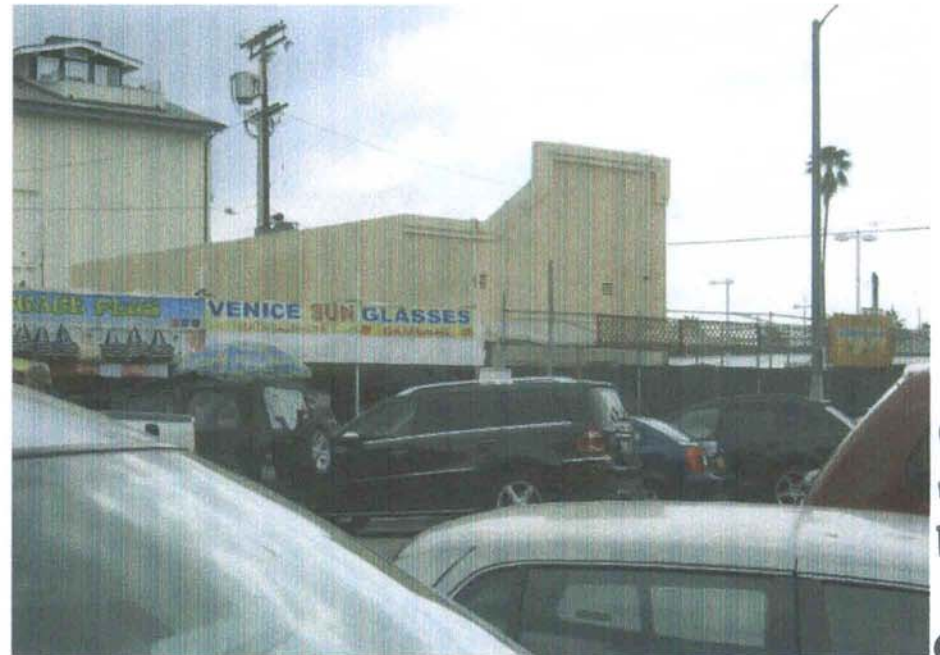
6 (Taken from Windward Ave towards front of the property)