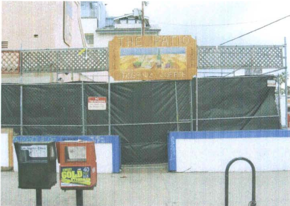
5 (Taken from Windward Ave towards the front of the property )