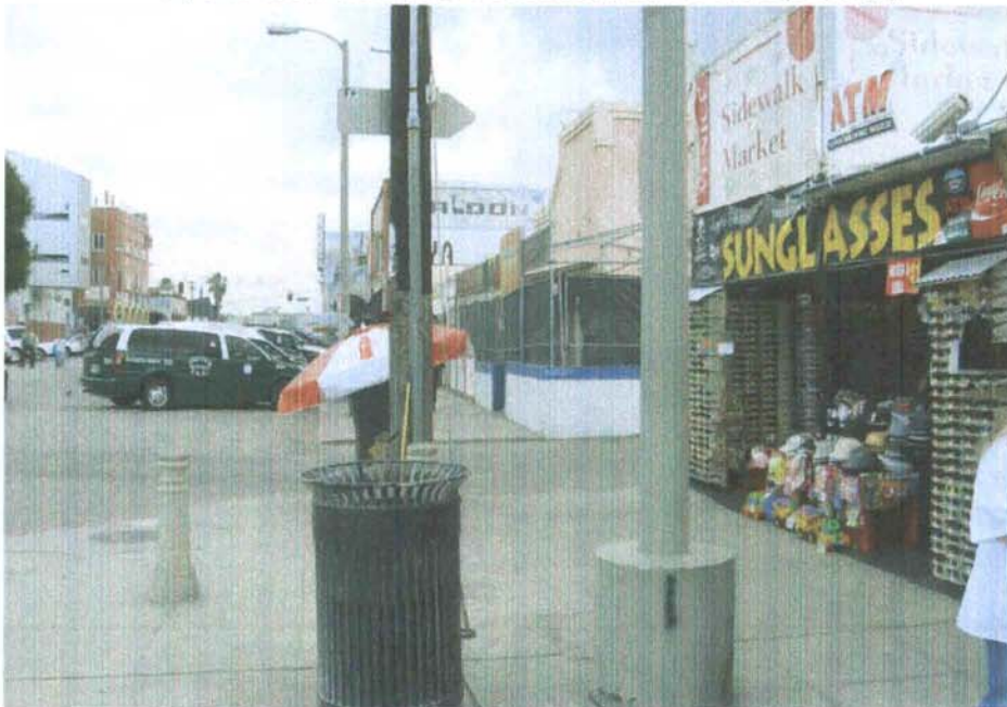
7 (Taken from Ocean Front Walk down Windward Ave)