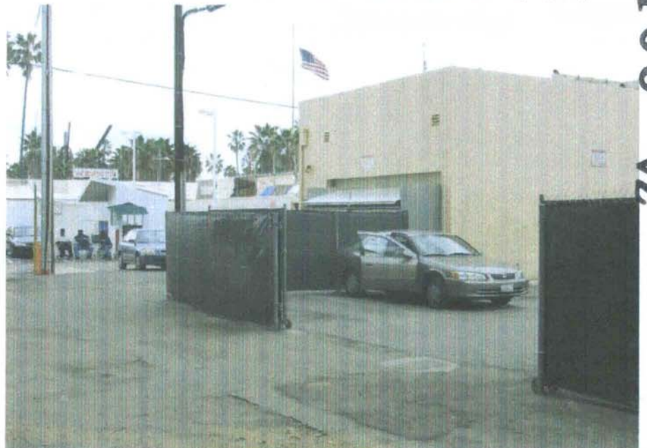
4 (Taken from Windward Court looking towards rear of property)