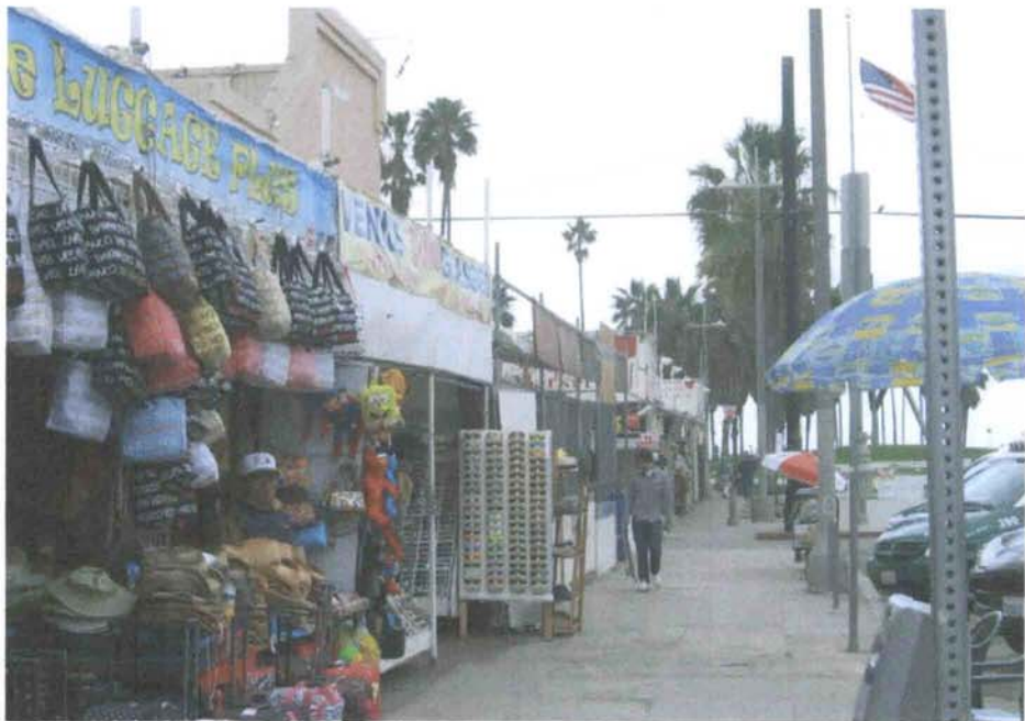
9 (Taken from the sidewalk on Windward Ave towards Ocean Front Walk )