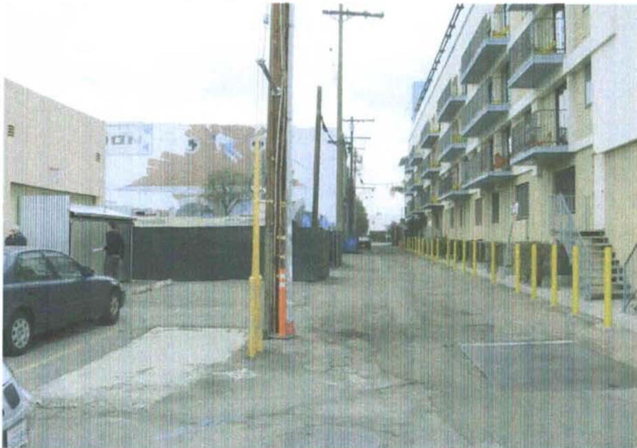
3 (Taken from Speedway looking down Windward Court)