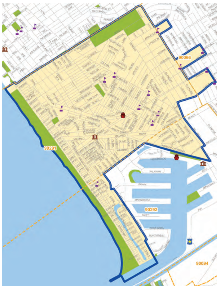
People who live, work, own property, or have a verifiable ongoing interest in Venice, are stake-holders and can vote in the VNC Board Elections. This map shows the boundaries of the Venice Neighborhood Council.

6:30pm - 9:00pm... Now on Zoom! https://zoom.us/j/81662263429 or call (888) 475-4499 and use ID: 816 6226 3429