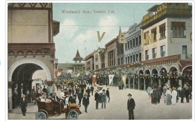
Venice Historic Tour TEST

Venice was built by Abbot Kinney in 1905 as a mash up of Venice, Italy and Coney Island. He dredged a "swamp" aka wetlands, to form islands and canals with iconic architecture, fantastic amusements, beautiful gardens and more. Come along for the ride.