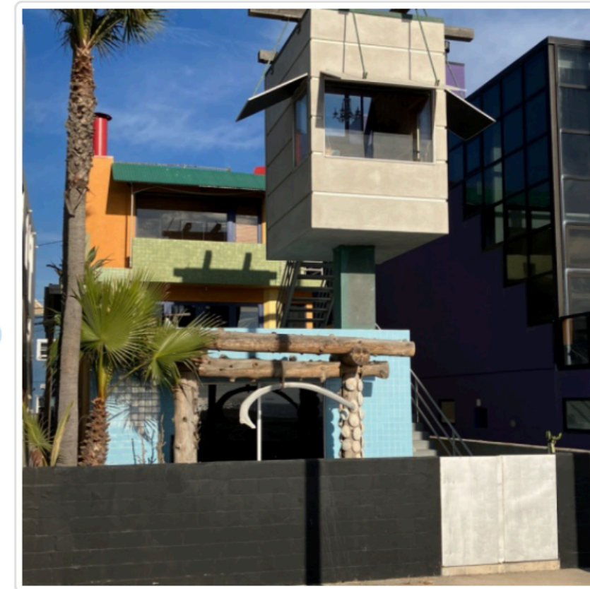
9 Norton Lifeguard House 2509 Ocean Front Walk Frank Gehry 1983

This point of interest is part of the tour: Venice Contemporary Architecture TEST