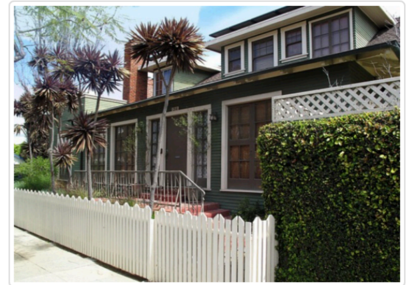
11 - Kinney-Tabor House 1310 Sixth Avenue

This point of interest is part of the tour: Venice Historic Tour TEST