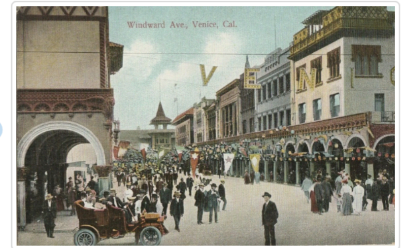
Venice Historic Tour TEST