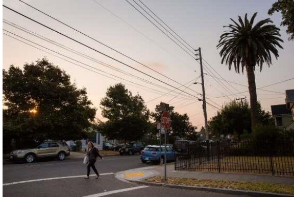
The Berkeley neighborhood where residents fought the plan for three units on a single lot. The proposal raised concern about building heights and parking spots, but it was in line with municipal regulations.