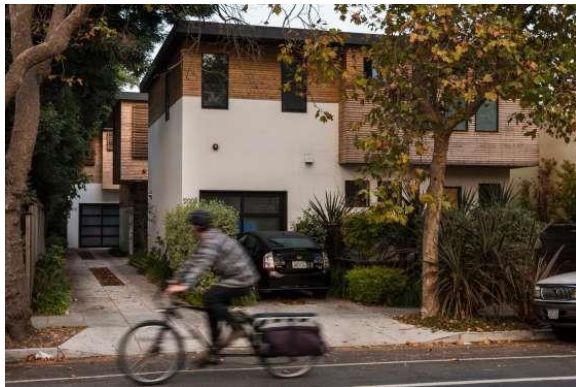
Some lots in Berkeley that once were home to single-family houses now have multiple dwellings, like this three-unit development. It resembles a proposal for the site at 1310 Haskell Street.