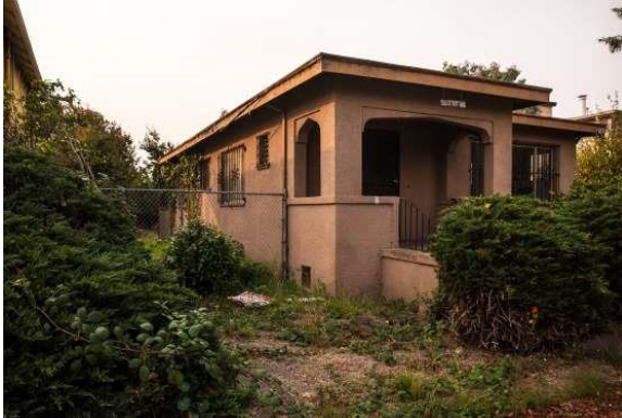
The property at 1310 Haskell Street in Berkeley, Calif., has been the focus of a protracted fight over denser development. Neighbors fought the plan for three houses on the site but lost.