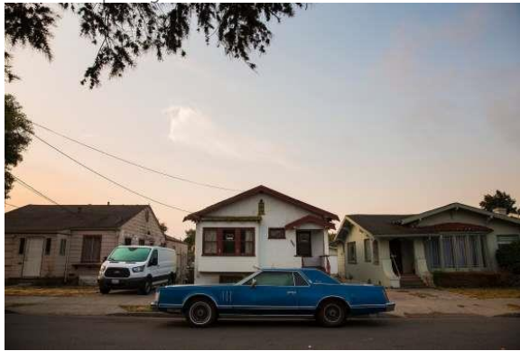
The approval of a state law making it easier to sue cities that deny housing projects could put development on a faster track.